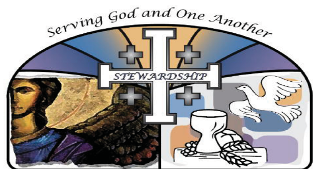
A Way of Life