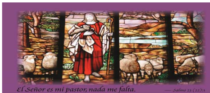
El Señor es mi pastor, nada me falta.